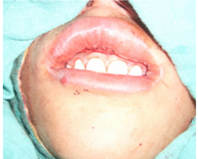
Fig.5: Appearance of the lip at the end of operation