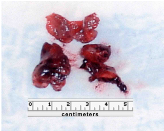
Figure 2: Central clots following removal by Fogarty catheter.