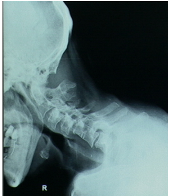
Figure 2: X-ray cervical spine lateral view in extreme flexion showing anterolisthesis at C4-C5 with C5&C6; block vertebra.