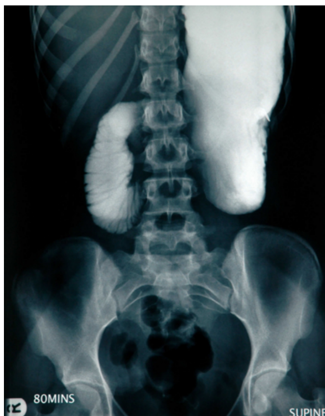
Figure 2: Contrast study showing complete obstruction of the duodenum at its third part.

A duodenojejunostomy was performed to bypass the obstruction. A steady and uneventful recovery followed where oral intake commenced after a week and discharge occurred after two weeks.