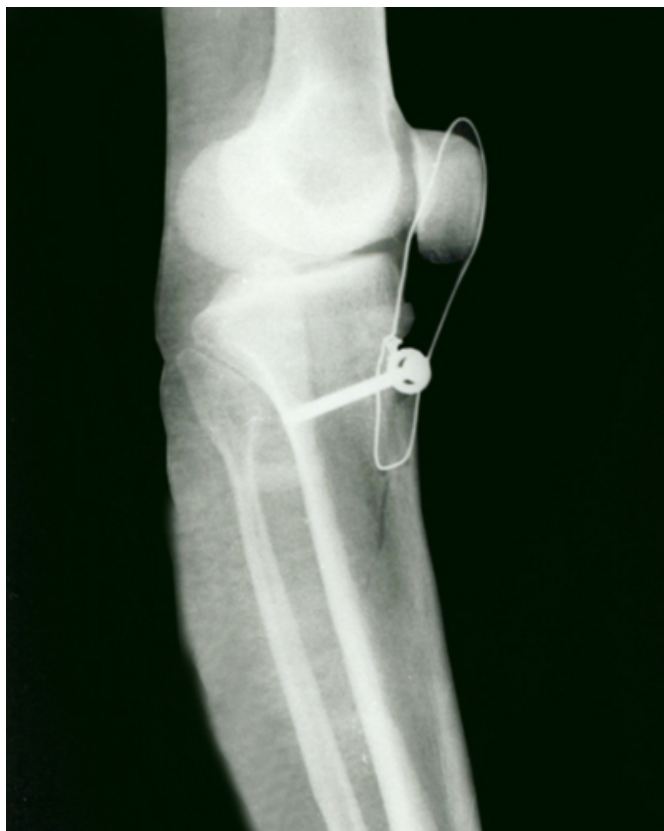
Figure 2: Postoperative lateral Xray shows fixation of the tibial tuberosity with screw and neutralization wire.