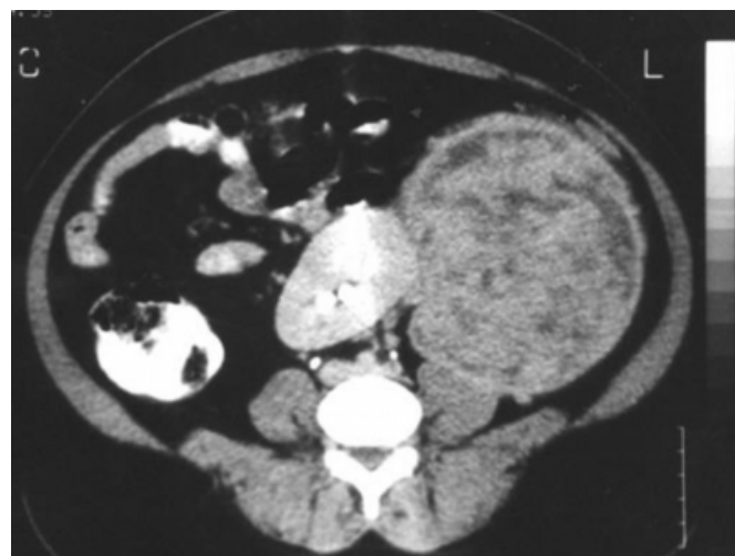
Figure 1: Computerized tomography of the abdomen showing tumor arising from the left kidney.