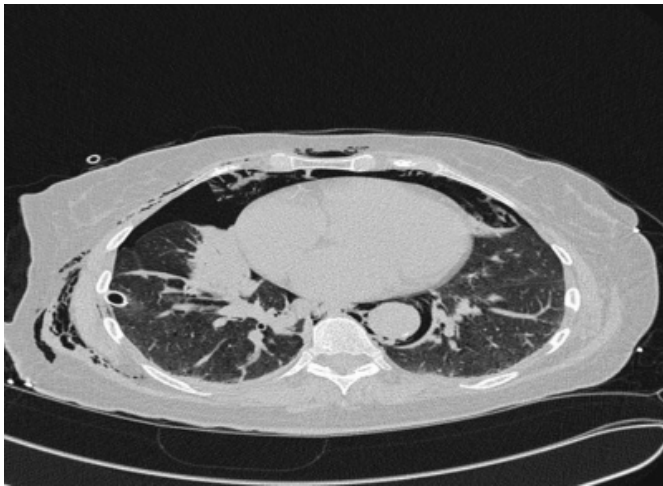
Fig 2 – CT Thorax showing pneumothorax and pneumomediastinum