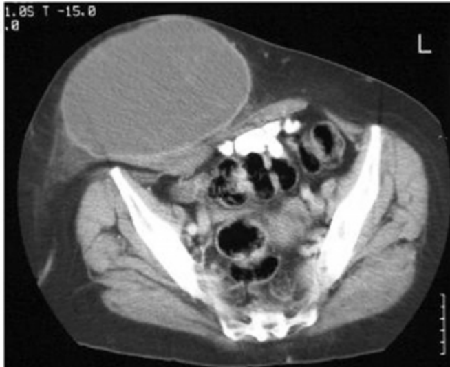
Figure 1: Contrast-enhanced CT scan show large fluid density mass lesion in relation to previous laparotomy scar.

Fine needle aspiration (FNA), was negative for malignancy. She was diagnosed as a AWC and surgical repair was recommended. She underwent an operation when an encapsulated mass was found in the midline, between anterior to muscle aponeurosis and subcutaneous tissue. The mass did not penetrate to the muscle aponeurosis plane. Local excision of the cystic mass and dermolipectomy was performed without any difficulty and was not necessary to utilize any prosthesis since the aponeurosis was harmless. The histology report confirmed the diagnosis of a unspecific cystic tumour without evidence of malignancy (Fig. 2 and 3). The postoperative recovery was uneventful, and the patient had a full recovery, with a follow up of twelve months.