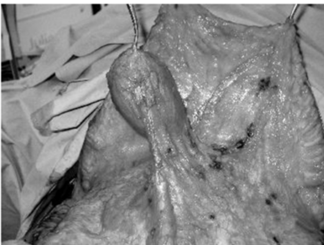
Figure 7: Intraoperative photo showed a cystic mass.