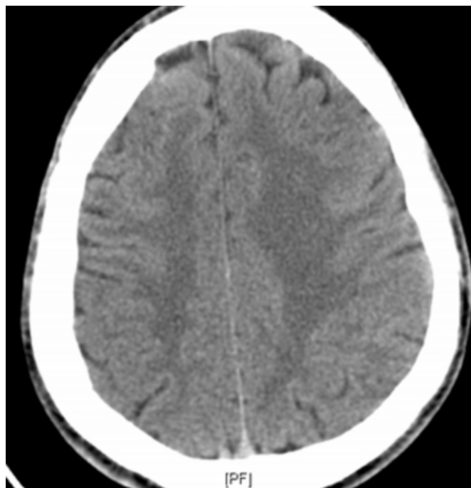
Figure 1 (A) showing normal CT scan on admission and (B) showing diffuse cerebral edema on 7 post admission day.