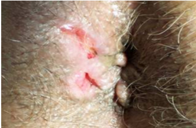
Figure 1: Perianal painful and ulcerative lesion with irregular margin

Microscopic examination with Ehrlich-Ziehl-Neelsen (EZN) stain of biopsy material was positive for acid-fast bacilli (Figure 2). From the culture of the biopsy specimen, tubercle bacilli were isolated on Löwenstein-Jensen medium. Sputum collected on three subsequent days was negative for tubercle bacilli. In addition, polymerase chain reaction (PCR) was positive for Mycobacterium tuberculosis . Histopathological examination of perianal lesion biopsies showed epithelioid granulomas and Langhans' type multinucleated giant cells (Figure 3).