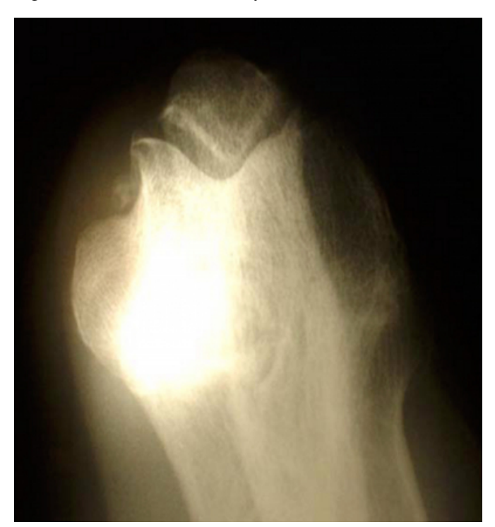
Figure 2: Sulcus view with bony encroachment in ulnar bed