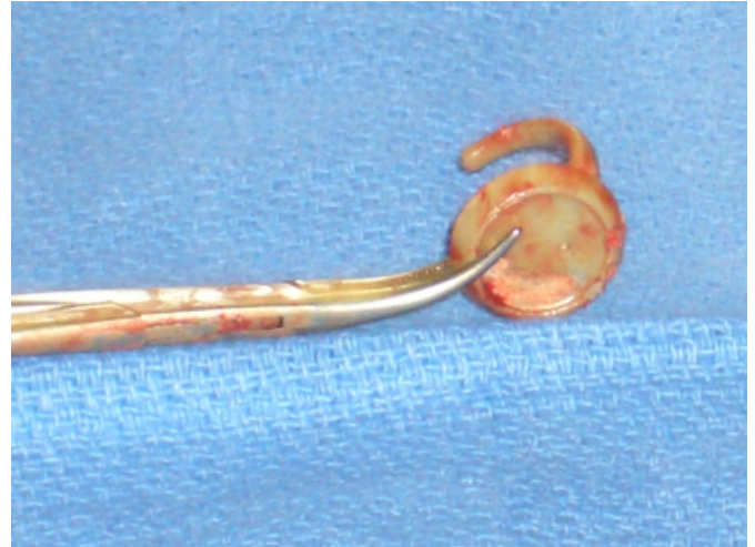
Figure 3: Retrieved lollipop ring