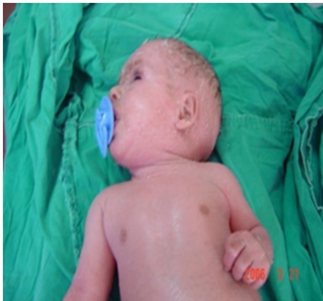
Figure 4: Post-treatment appearance of the patient.