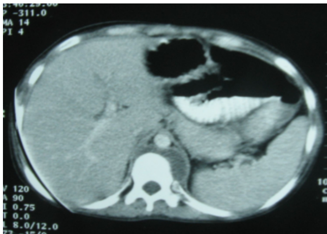
Figure 2: CT abdomen showing lytic lesion in D 12 vertebrae with paravertebral collection.

USG guided tap from abdominal fluid collection as well as from Para vertebral collection was performed which showed acid fast bacilli. Patient was managed conservatively. Antitubercular therapy was started from the next day. Patient had a seizure in the wards on the 3 rd day. CT scan of the brain showed tuberculoma in right parietal region (figure 3).