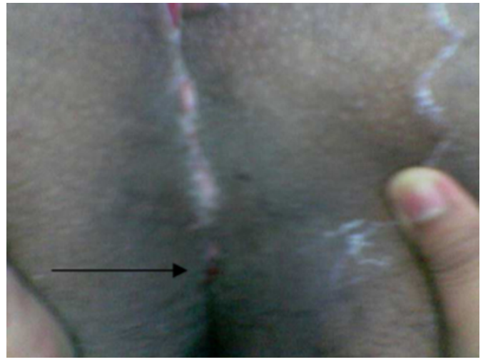
Figure 3: Post operative a new opening lower down helped by hairs around