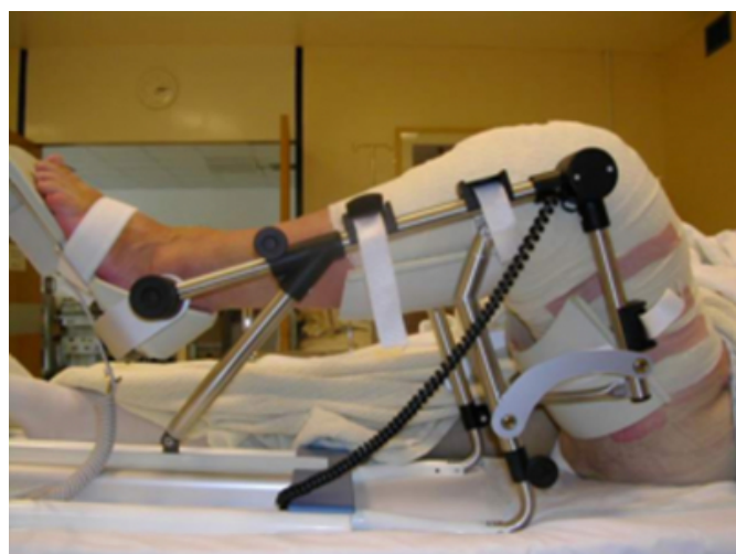
Figure 1: Post-operative picture of use of CPM machine to maintain 90 ° flexed position.

Patients in the two groups underwent standardized postoperative regimen. A standard DVT prophylaxis protocol was used in all patients, which comprised of intra-operative intermittent calf compression pumps followed by TED stockings and Aspirin 150mg for 6 weeks in the post-operative period. Measurable blood loss was recorded from the drains on the ward after 24 hours and the suction drains were removed after 24 hours if there was no further drainage. The haemoglobin level and haematocrit were checked at 24 hours in both the groups after the operation. Physiotherapists performed routine active and passive range of motion (ROM) exercises with the patients, from the first post-operative day. The post-operative ROM was also recorded at 24 hours in both the groups.