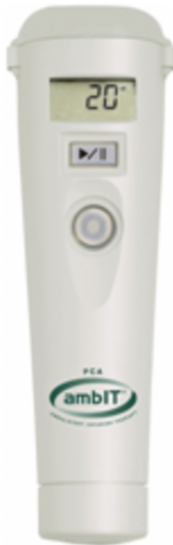
Figure 1: Ambit ® PCA infusion pump()