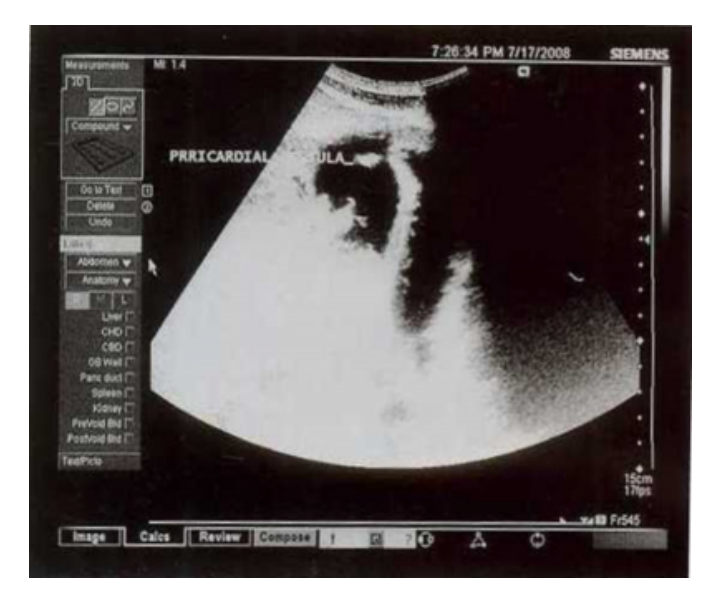
Figure 2: Ultrasound scan showing a pericardial fistula

Surgical consultation for this case was sought after these sonology findings and immediately drainage of the abscess was planned. A No. 16 Ryle's tube was put in the left lobe abscess through the shortest route, under ultrasonography control. About 500 cc of anchovy-sauce pus was drained within ten minutes, leading to significant improvement in the symptoms of the patient. During this procedure, we could demonstrate the drainage of pericardial effusion through the pericardial fistula and the subsequent film revealed a significantly decreased amount of residual pericardial effusion.