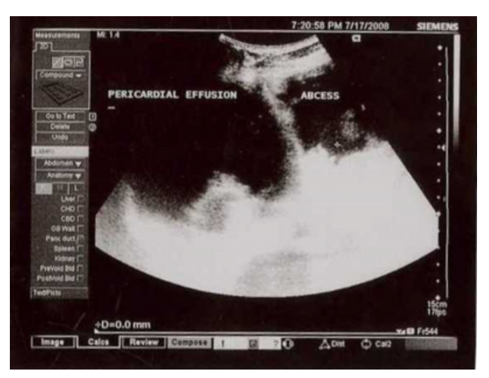
Figure 1: Ultrasound scan showing a hepatic abscess in the left lobe with pericardial effusion.

On a further ultrasound scan of the patient, we could demonstrate the communication between hepatic abscess and pericardial effusion, i.e. pericardial fistula.