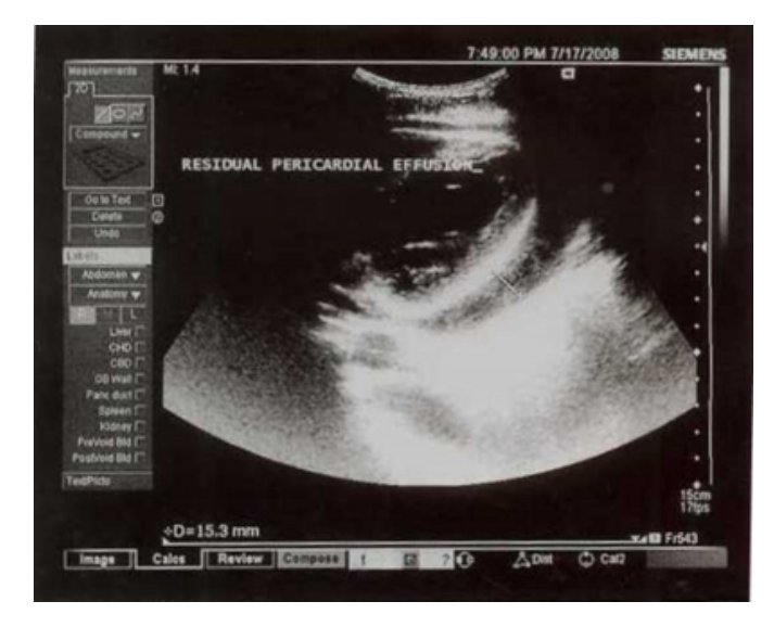
Figure 3: Ultrasound scan showing residual pericardial effusion