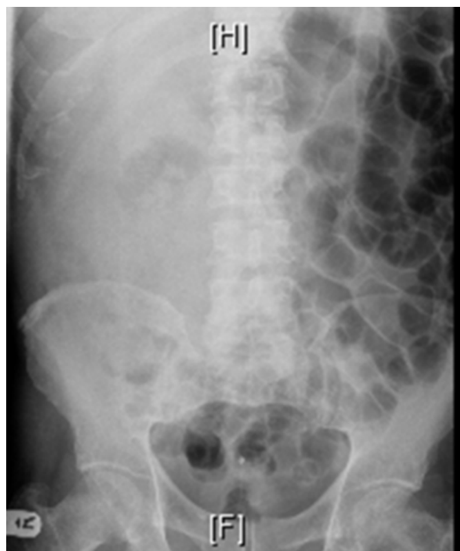
Fig:2 dilated smallbowel loops.

Broad-spectrum antibiotics were commenced and he was resuscitated for an exploratory laparotomy, which revealed gangrenous perforated ischemic ascending colon causing faecal peritonitis. A right hemi-colectomy was performed with an end-ileostomy and mucus fistula formation.