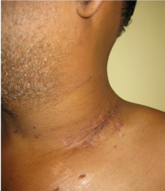
Figure 3: Complete resolution of left IJV thrombosis