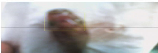
Figure 3 : A typical behavioural changes in the exposed fish. Curling of Spine and vertical movement of the fish due to loss of equilibrium is depicted. Due to complete loss of equilibrium, fish turned upside down and finally died as can be noticed in the picture.

Efforts were made to carefully observe the behaviour of the fishes during the 96-hr study. Behavioural functions are generally quite vulnerable to contaminant exposures, and fish often exhibited these responses first when exposed to pollutants (Little et al., 1993). Behavioral changes such as curling of spine and vertical movement (Fig.4.3) of the fish was observed. This may be due to loss of equilibrium at high intoxication which makes the fish to turn upside down and finally died. Thus, swimming performance is considered one of the measures which could serve as possible sensitive indicator of sub-lethal toxic exposure. Various methods have been used to quantify the effects of toxics on an organism's swimming performance (Rose et al., 1993). This kind of behavioural abnormality has been reported in various fish species on exposure to heavy metals (Little et al., 1993). Frequent surfacing with irregular opercular movement and loss of equilibrium in Tilapia mossambica has been reported when exposed to cadmium (Ghatak and Konar, 1990). Similarly, hyperactivity, erratic swimming, and loss of equilibrium in brook trout, Salvelinus fontinalis , in response to lead treatment have been reported (Holcombe et al., 1976). In addition, Singh and Reddy (1990) in their study on Heteropneustes fossilis , had reported lethargy response and frequent surfacing along with gulping of air in exposure to