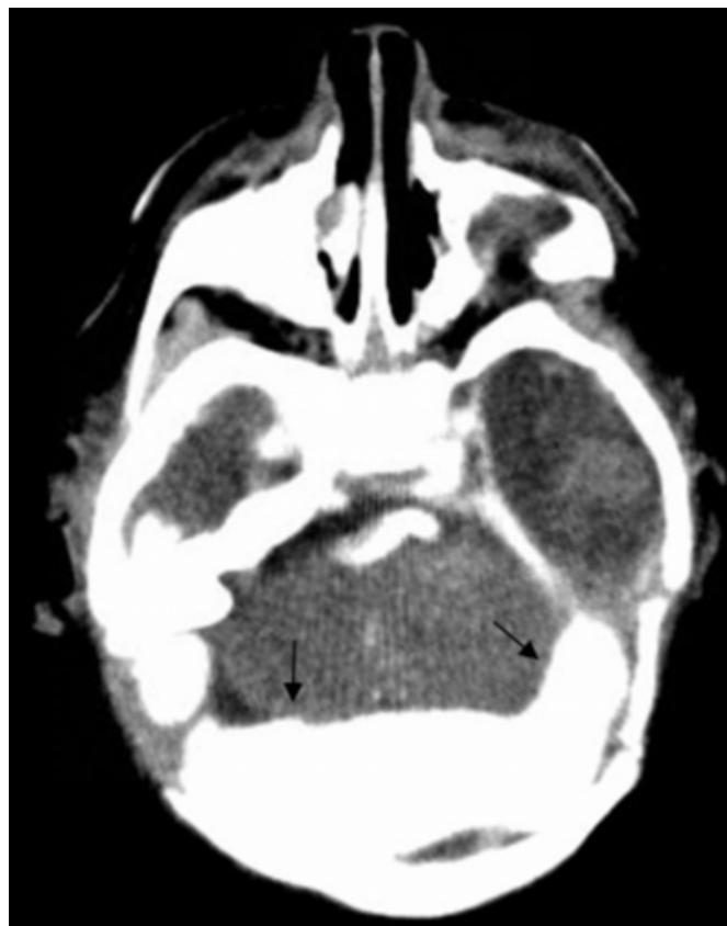
Figure 4: CT angiography axial image showing bilaterally enlarged transverse sinus (arrows).