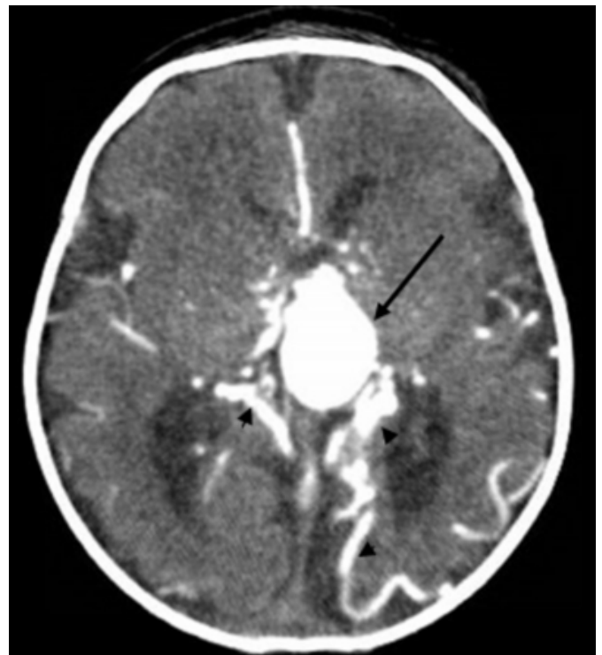
Figure 2: CT angiography axial image showing enlarged median prosencephalic vein ( large arrow) with multiple arterial feeders ( small arrows).