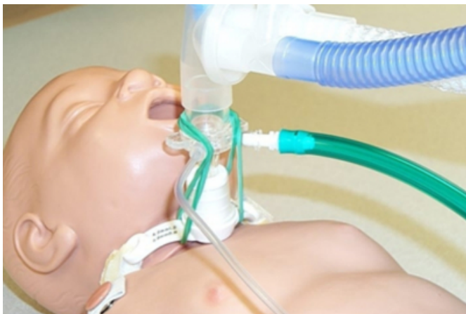
Figure 3 : Method for attaching the HFJV to the Life Port adapter and securing it to the tracheostomy tube using a rubber band.

The infant had a marginal improvement in oxygenation on HFJV but remained in need of 1.0 FiO 2 . After four days without improvement, a mutual decision to discontinue support was made between the parents and the care team in