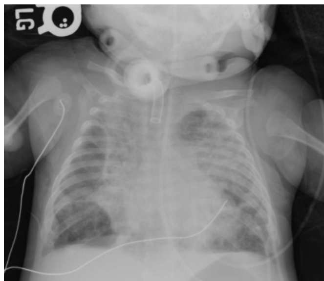
Figure 1: Chest radiograph obtained while receiving HFOV.

After a brief improvement, oxygenation deteriorated. He was then tried on the Life Pulse High Frequency Jet Ventilator (HFJV) (Bunnell Inc., Salt Lake City, UT, USA), using the volume strategy described by Keszler et al 1 (Figure 2).