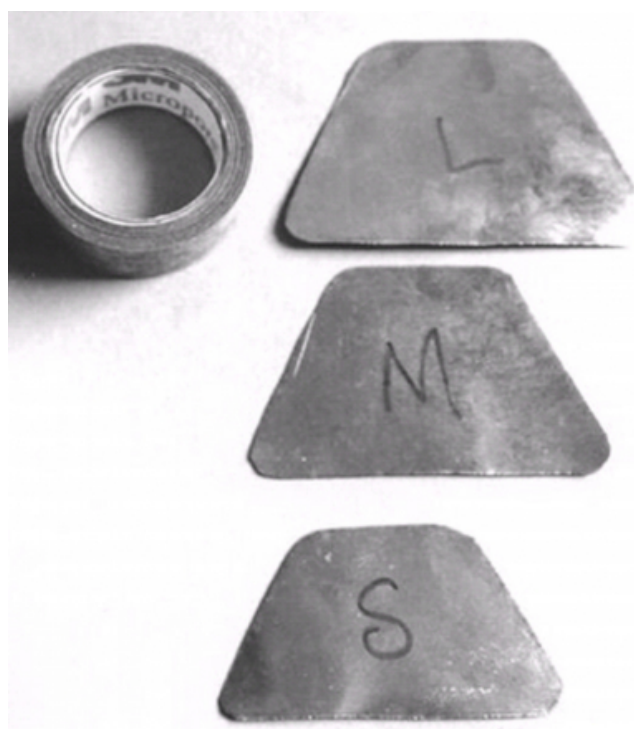
Figure 1: Sizes of nasal splints