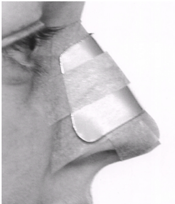
Figure 3: The splint secured in place

During two year period (2002-2004), we have applied the custom made splint on total of 50 patients. The splints have been used on 28 patients after septorhinoplasty and on 22 patients after manipulation of fractured nasal bones. We reviewed all the patients at seven to ten day periods for removal of the splint. None had splint related complications and there were no complaints from the patients regarding the custom made splint.