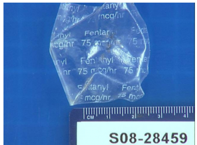
Figure 3: Gross specimen - Fentanyl patch removed from bifurcation of left superior and inferior bronchi