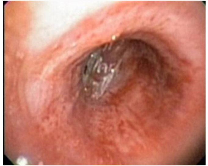
Figure 2: Bronchoscopic view. Fentanyl patch lodged within the bifurcation of the left superior and inferior bronchi