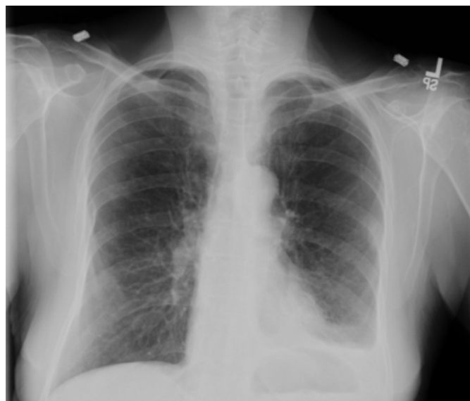
Figure 4: Chest X-ray resolution of left lung opacification and mediastinal shift post foreign body removal