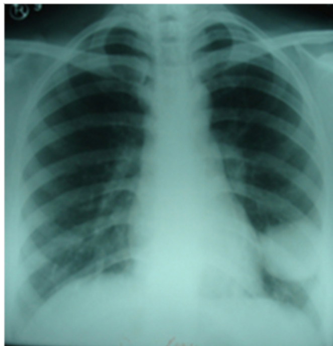
Figure 1: Chest X ray PA view showing a well defined radio-opacity in left lower zone

CT thorax showed a well margined rounded cystic lesion in the left lower lobe, anterobasal segment with no calcification or surrounding consolidation (Fig 2).