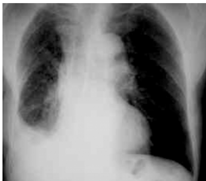
Figure 1. (A) Left; Chest roentgenogram at the initial day of right sleeve middle and lower lobectomy. The trachea was shown a shift to the right and the left main bronchus was branched off with a larger angle than usual