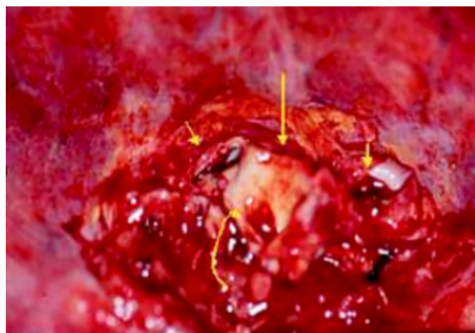
Figure 2. Right main bronchus (straight arrow) and the branches of the pulmonary artery (arrow heads). A deep ulcer was formed in the mucus of the bronchial wall (curved arrow). The direct communication path was not demonstrated in this view

This completion pneumonectomy once saved the patient's life, but bronchopleural fistula and pyothorax was developed three days after emergency thoracotomy. A chest tube was inserted into his right hemithorax, and he was managed with antibiotics. A culture of the pleural effusion from his chest