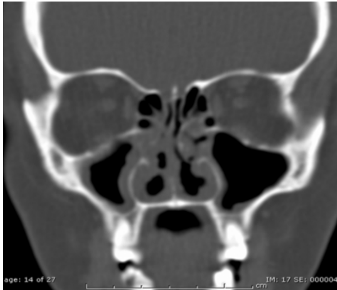
Figure 3: CT scan nasal sinuses showing blockage of the osteo-meatal complexes and mucosal thickening over the maxillary and ethmoidal sinuses

The patient was listed for functional endoscopic sinus surgery and had bilateral middle meatal antrostomies and antral washouts. Biopsies were taken from the hypertrophied inferior turbinates and these confirmed the diagnosis of sinonasal sarcoidosis.