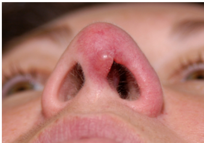
Figure 1: "Lupus pernio" purplish nodule to the tip of the nose

The patient stated that she had developed this lesion in the last six months. She was referred to the dermatology