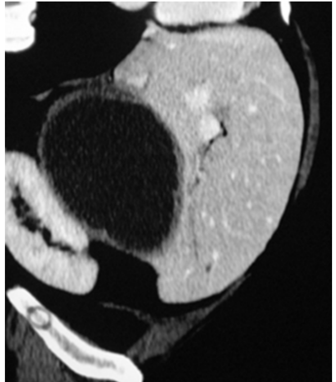
Figure 3: Abdominal CT (sagittal image) revealing that there is no infiltration to adjacent organs

Due to the septic state of the patient and to contained rupture of the abscess we opted for open surgical drainage. Thirty