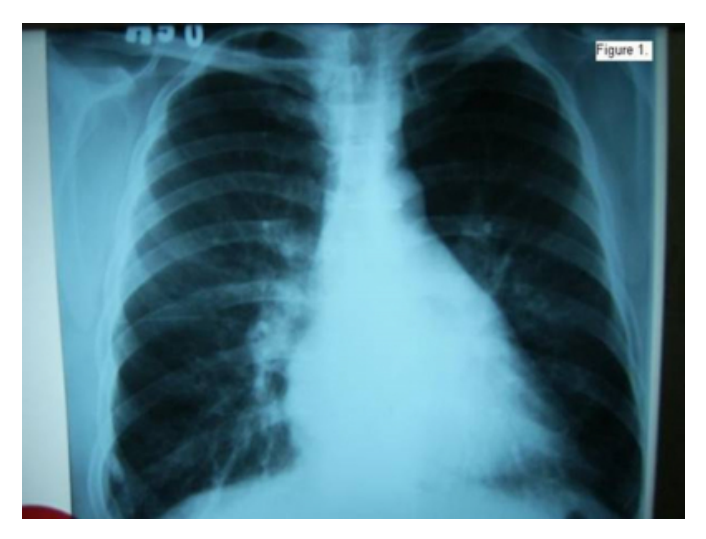
Figure 1: Posteroanterior chest radiography of the patient with massive hemoptysis. Enlarged right pulmonary artery is seen.

ECG revealed that the patient was in sinus rhythm. Helical contrast-enhanced CT revealed no a parenchymal nodule, cavity or infiltrate, endobrochial mass, bronchiectasis and vascular abnormality such as emboli in the pulmonary arteries. Since he had prosthetic aortic valve due to rheumatic fever, it could be associated with MS. So, a careful and detailed cardiac auscultation revealed a loud first heart sound, a rumbling, low-pitched diastolic murmur localized to the apical area. Patient had no apparent clue of the LVF such as S3 gallop, disseminated fine crackles in the lung areas and peripheral oedema. Also, he had no cardiomegaly on CXR. Complete echo revealed a severe MS (mitral valvul area: 1.0 cm2 and a mean mitral valve gradient of 18.8 mmHg by Doppler) with thickened and calcified mitral leaflets (Figure 2). Grade 1 mitral regurgitation and grade 2-3 tricuspid regurgitation were established. Mean pulmonary artery pressure (PAP) was 50.2 mmHg by Doppler Echo. He had left atrial enlargement (51 mm) with normal functions of left ventricular ejection fraction and mechanical aortic valve.