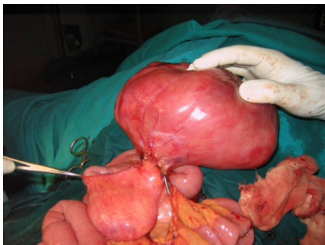
Figure 2: Dumbbell-shaped tumor

Grossly, the tumor measured 20x18x13cm. The dumbbell actually comprised two tumors of the same histology with