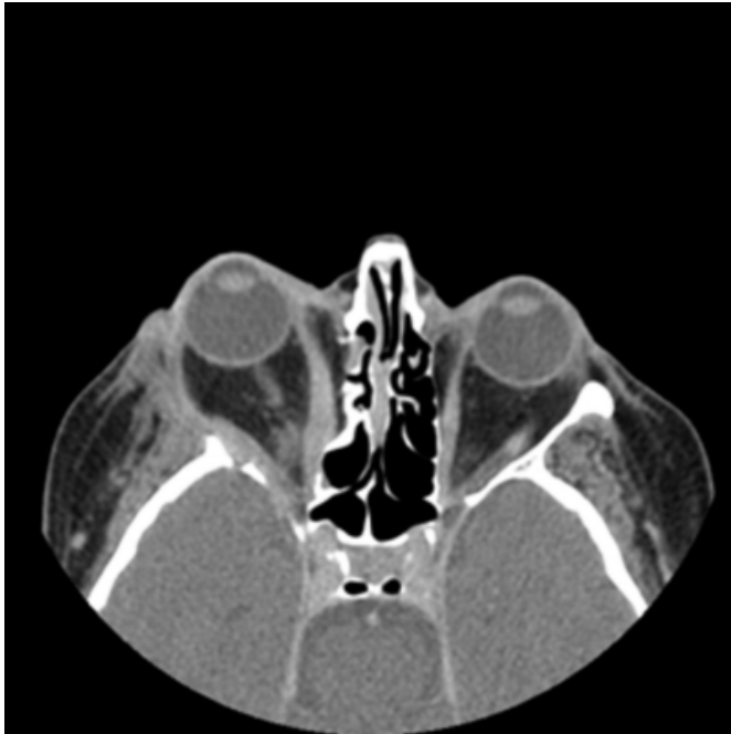
Figure 4; CT scan at 1 year follow up shows resolution of right orbital myopathy