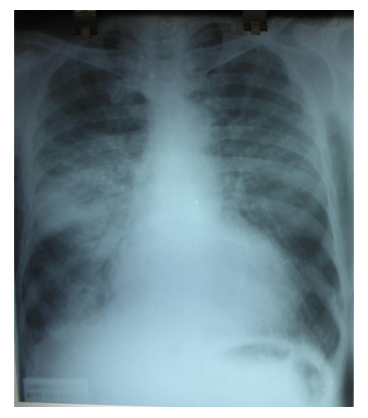
Figure 1: Chest Xray PA view on admission shows sharply marginated biconvex opacity in the right interlobar fissure.