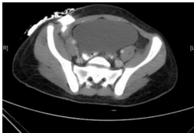
Figure 1: Oral contrast CT scan showing extravasations of contrast dye at the level of the caecum.

The patient was admitted and kept on intravenous fluids, intravenous antibiotics and regular dressings for 10 days before his transfer.