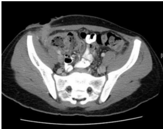
Figure 3: CT scan 6 weeks later showing complete closure of the fistula.