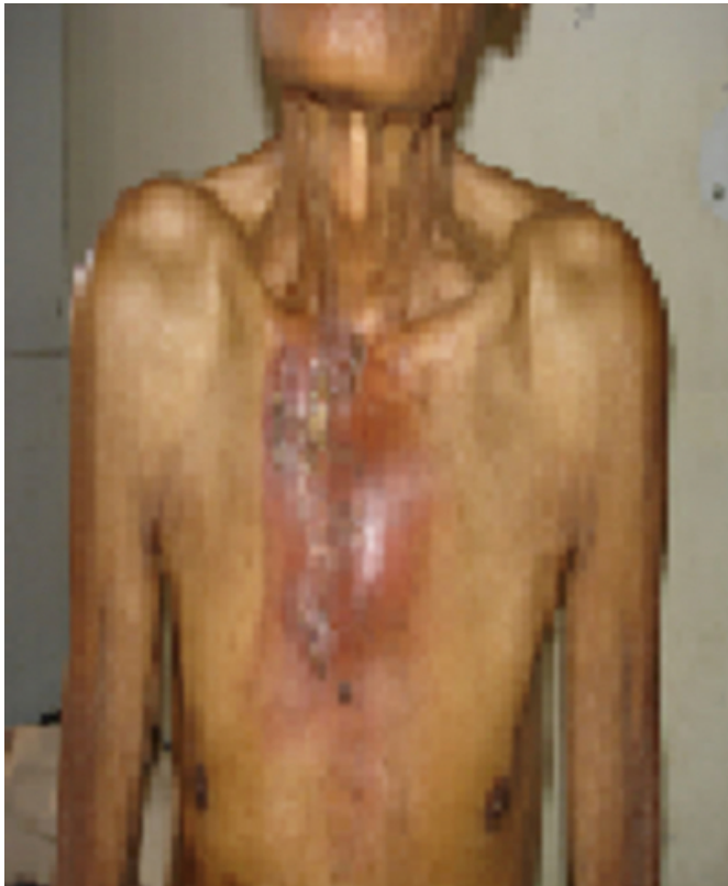
Figure 2a: Discharging sinuses