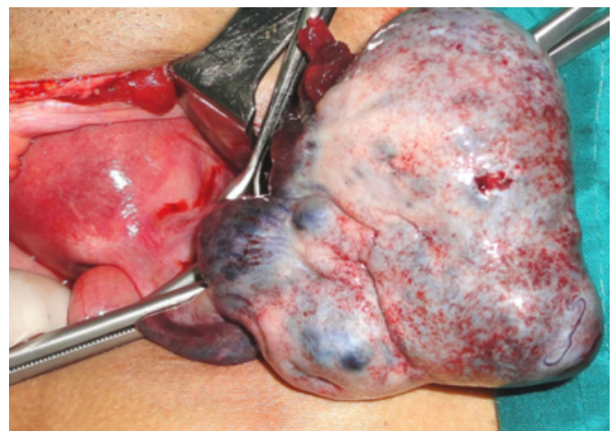
Figure 1. First trimester pregnancy with ovarian mass in case 1