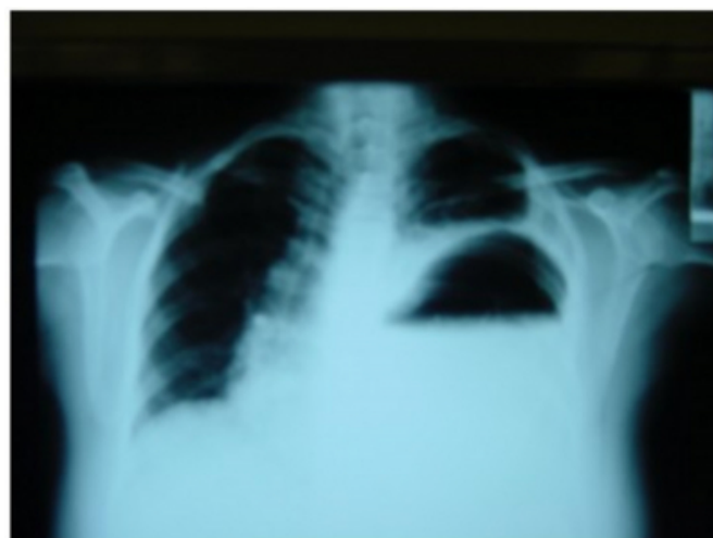
Fig 1. Chest x-ray after barium meal showing stomach in left hemithorax

The diagnosis of diaphragmatic hernia was made and she was scheduled to undergo surgical repair. In the operating theatre, suctioning of stomach secretions was done through nasogastric tube followed by injection of 30 ml of non-particulate anti-acid through. Anesthesia was induced in a rapid sequence order with propofol 170mg and fentanyl 100mcg followed by cricoid pressure. Endotracheal intubation was facilitated with succinylcholine 70mg. Left sided, double-lumen endobronchial tube (DLT) was used (35Fr). Fibro-optic bronchoscope was used to confirm correct position. Anesthesia was maintained with N 2 O/O 2 , and 1 MAC sevoflurane. During surgery, the following parameters were continuously monitored: ECG, end-tidal CO 2 (Capnography, Datex, Finland), peripheral O 2 saturation (SpO 2 ) (Ohmeda, USA), non-invasive blood pressure