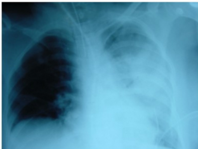
Fig 2. Post-operative uni-lateral pulmonary edema

The intercostal tube was in situ, draining serous sanguineous fluid. Frusemide 50mg was given i.v. Her ABG showed PO 2 of 105 mmHg on FiO 2 of 1.0, with copious amount of whitish tracheal secretions. Controlled ventilation was