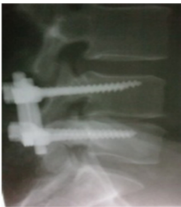
Figure 2. Lateral view of the lumbar spine showing L4/L5 transpedicular fixation Following discectomy.

Post-operative course: rehabilitation was done a week later. He progressed very well. He resumed light duty six months after the operation. He was reviewed a year later; he was completely independent. He had full bladder and bowel control. The motor power had improved bilaterally and