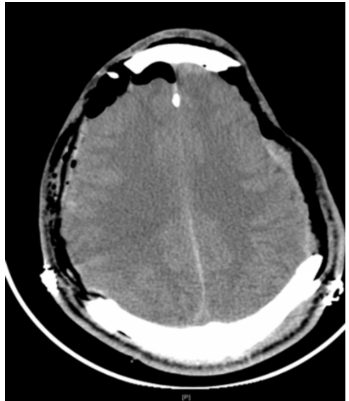
Figure 1. Axial head CT showing bilateral craniectomies for evacuation of subdural and epidural hematomas.