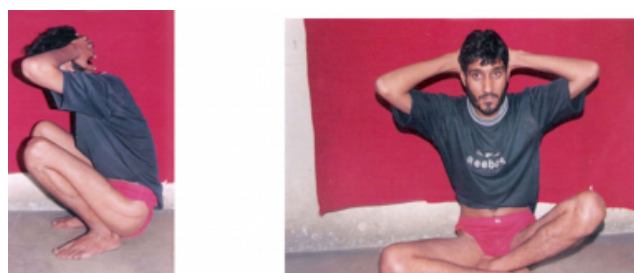
Figure 2 (a) Patient (whose x-rays are shown in figure 1) squatting