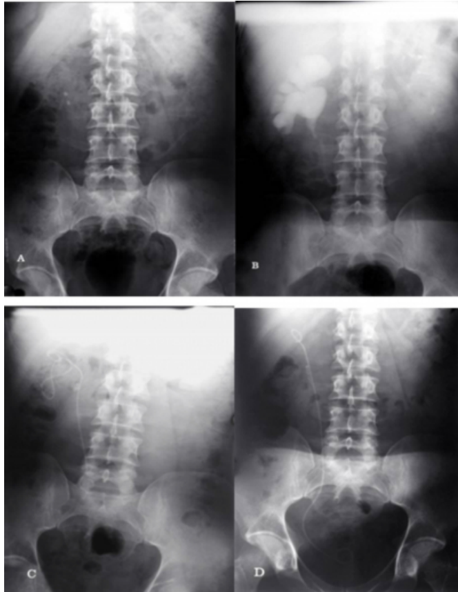
Figure 1 AB: Plain abdominal x-ray and IVU are showing proximal ureteral stones and grade IV hydronephrosis on the right-sided urinary system. C: Plain abdominal x-ray is demonstrating upward migrated DJ stent on the same side. D: Post-operative first day plain abdominal x-ray is showing successful fragmentation (stone-street).

The patient was discharged post-operative first day. The patient received intravenous first generation cephalosporin preoperatively, which was maintained 7 days an oral quinolone. The DJ stent was removed by cystoscopy under local anaesthesia two weeks after the treatment. An IVU was obtained after the withdrawal of the DJ stent on the third week and it showed complete stone clearance except mild dilatation on the right-sided urinary system (Fig.2A,B).