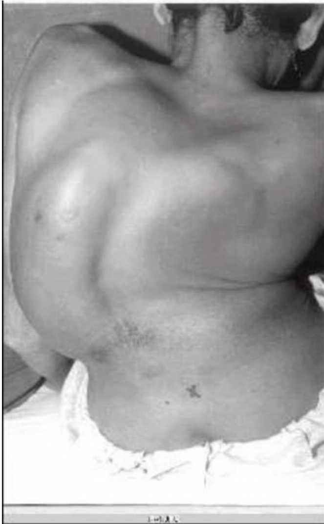
Figure 2: View from back

Injection of Glycopyrrolate 0.2mg was given as premedication. The patient was preloaded with 500ml of crystalloid. In the sitting position, the right posterior superior iliac spine (PSIS) was identified. A point 1cm below and medial to the PSIS was marked 2 (fig.3).