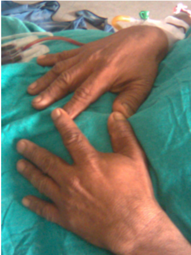
Figure 3: Drumstick like short fingers and wrinkled skin over dorsum of fingers

Upon arrival in operating room intravenous access was established. Monitoring of Electrocardiograph, heart rate, SpO 2 and NIBP was done. Spinal anaesthesia was given with injection bupivacaine hydrochloride, 2.0 ml at L2-L3 space under all aseptic precautions, in sitting position in single attempt. The patient then positioned supine and a sensory level up to T10 was achieved. Intra-operative and Post-operative period was uneventful. The patient was discharged home on 7 th day.