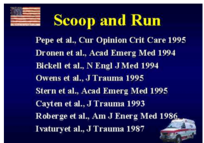
Figure 1: Supporters of the "scoop and run" system: