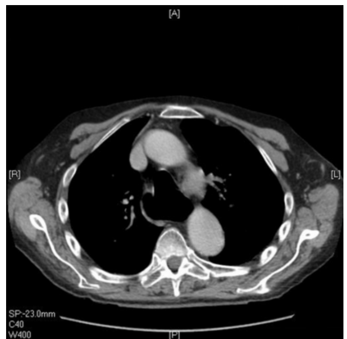
Figure 3: Computerised tomography (CT) of thorax: Dilated oesophagus compressing the trachea

Whilst in hospital, the patient continued to eat and drink as