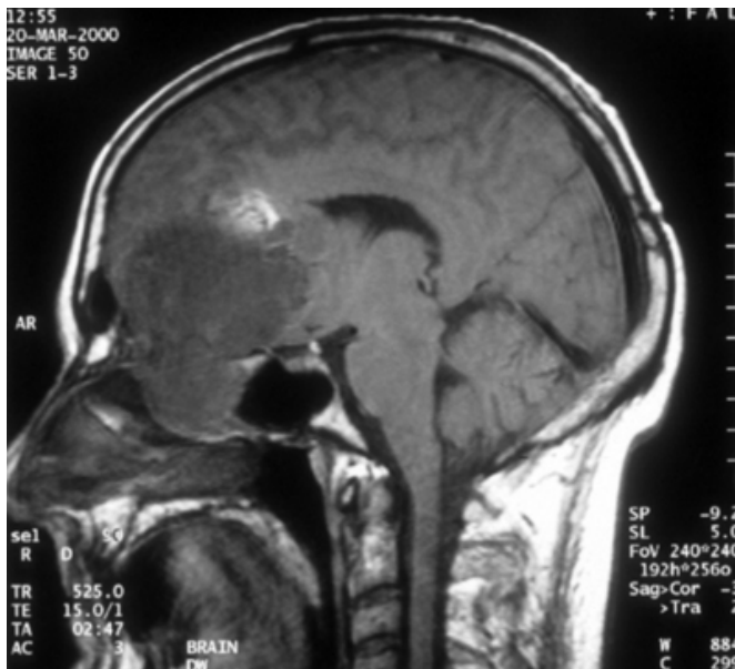
Figure 2: Sagittal MRI again demonstrating ethmoid sinus involvement spreading to brain