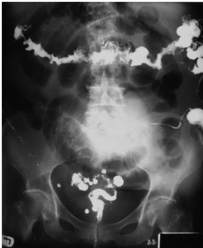
Figure 3: Plain abdominal x ray – small+large bowel dilatation