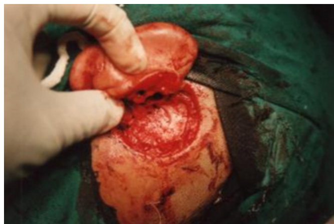
Figure 2: Mastoid obliteration with hydroxyapatite.