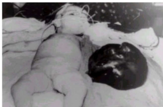
Figure 1: A huge mass occupying the whole abdominal cavity is surgically excised.