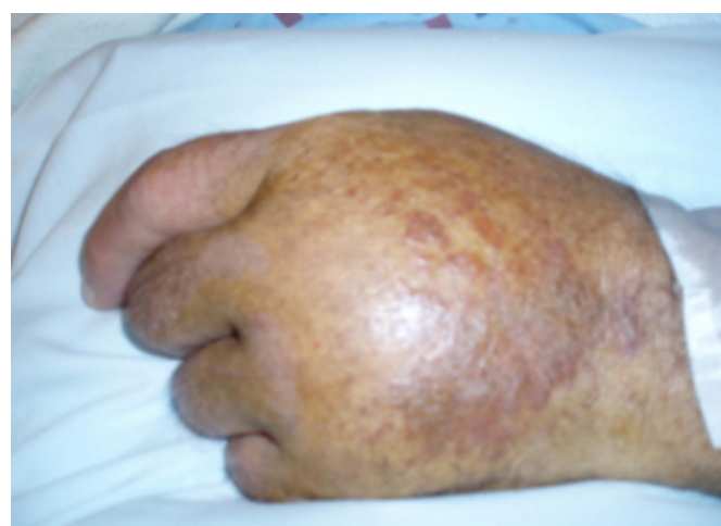
Fig. 1: Chronic edema of the left hand due to venous hypertension

The aneurysm grew to enormous size to cover the whole of his forearm (Fig. 2). The patient finally agreed to excision of the aneurysm and stated that he wanted the surgery for cosmetic reasons.