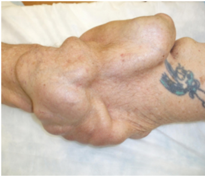
Fig. 2: Giant aneurysmal dilatation of AVF

The patient underwent excision of the giant AVF aneurysm on July 21, 2008. The incision was made at the arterial end and brachial artery control was achieved using a vessel loop. The incision was extended as necessary during the process of excision of the aneurysmal fistula. The aneurysm measured 9cm in its maximum diameter. A stenosis was found at the venous end which is marked by a vessel loop in figure 3.